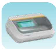
Micro Plate Reader/Washer