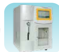
Liquid Partical Counter